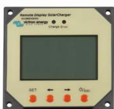
Remote display for BlueSolar DUO 12/24-20