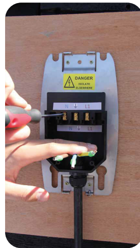
Unscrew the 6 screws (10 screws if installing a 3-phase unit), feed the cable through the gland and secure. Prepare the ends with ferrules.