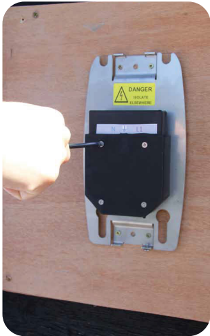
Unscrew the cover on the benector.