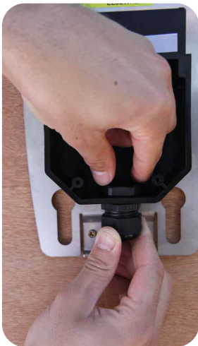
Fit the correct sized gland for your power cable.