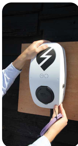
Offer up the charger to the base plate. (If installing an eoGenius ensure that the data cable does not get trapped).