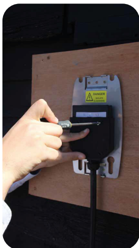
Replace the cover