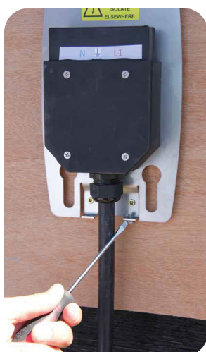
An additional screw is provided should you need another earth connection.