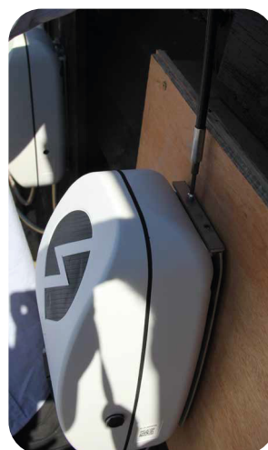
Replace the locking plate and screws to secure the unit. Power up the unit and test.