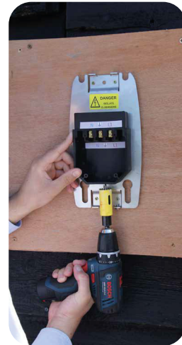
Using a hole cutter, cut a hole into the benector the correct size for the gland.